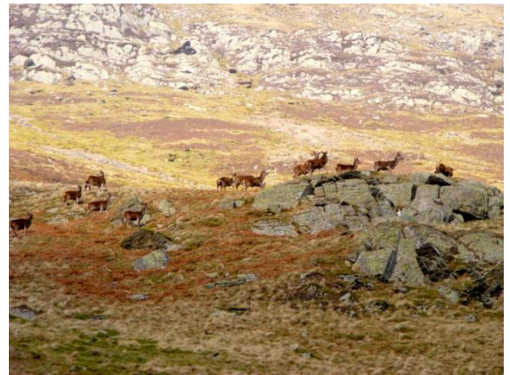
Deer running wild in Boredale

Holbeck Lane, Windermere, Cumbria LA23 1 LU T: +44 (0) 1539 432 375 E: stay@holbeckghyll.com Web: www.holbeckghyll.com