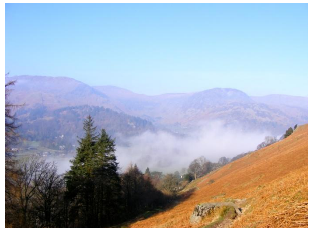
From Boredale Hause looking into Patterdale